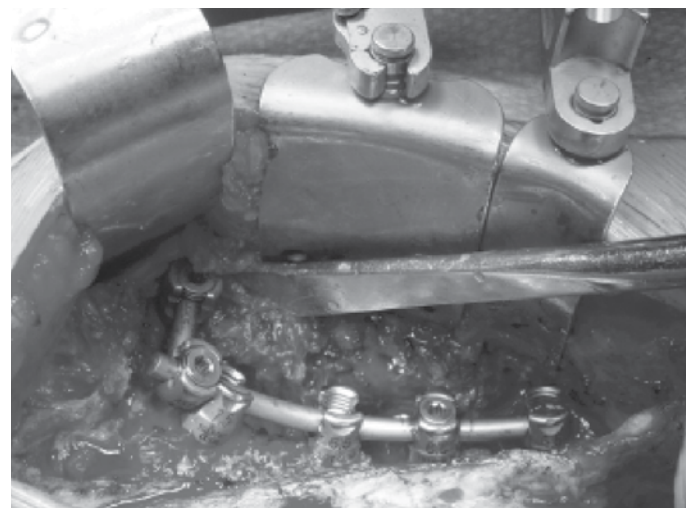
Figure 4. Transsurgical photograph of a construction through lumbopelvic fixation. Note the rod connecting to the iliac screw.

The approximate surgery time was 5 hours, SD 1 and there was average bleeding of 1380, SD 178. (Table 1).