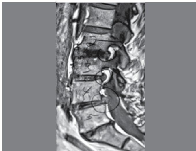
Figure 2. MRI of patient requiring a comprehensive decompression that needed long instrumentation, opting for a lumbopelvic fixation.

The evaluation of grip is considered tricortical, because the screw in this zone grips the anterior and posterior cortical and bone elements of the terminal plate, giving it a certain mechanical advantage. 5,8 (Figure 3)