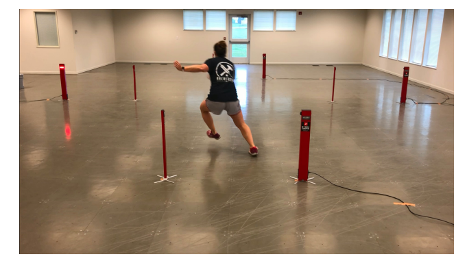
Figure 2. Reactive agility testing using laser timing gates

Lastly, while a thorough discussion on acute:chronic workload ratios is beyond the scope of this paper, the authors of the manuscript would be remiss to not mention the importance of the concept, especially in light of the current RTS Consensus Statement. Simply put, as an athlete transitions back to participation, sport, and performance, it is important to achieve and maintain optimal loading. Monitoring an athlete's current training load (acute) against the