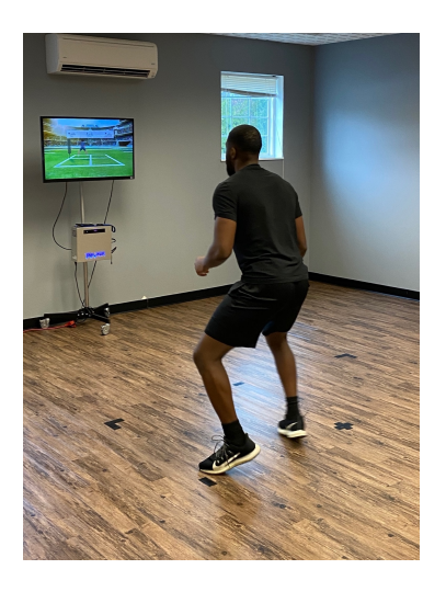
Figure 3. Lateral agility screen using Trazer computer system

ing. The time is now to push the envelope forward. Please consider joining the movement.